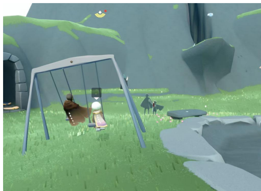
Figure 5. The Screenshot 5