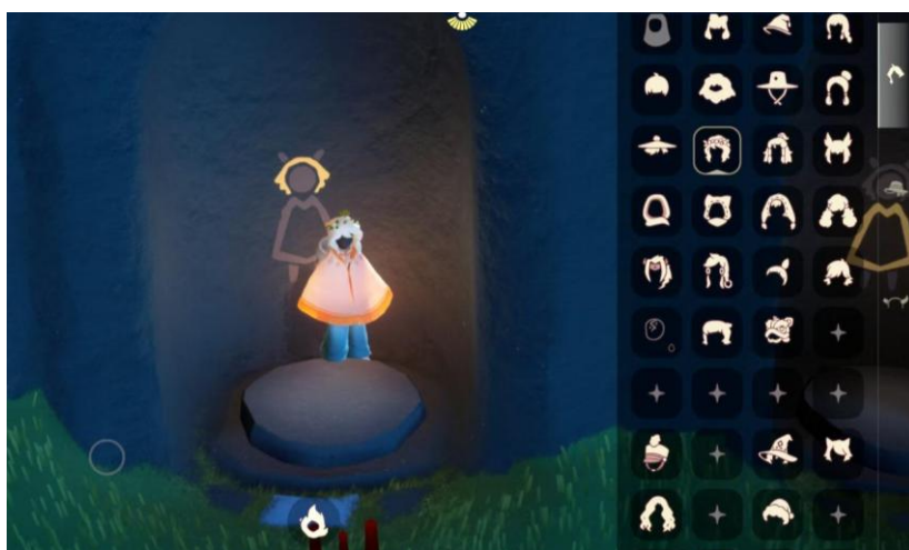
Figure 2. The Screenshot 2

At each of these different wardrobe sections, players can browse and choose from the clothing items they already possess. These items are typically acquired using in-game currency such as hearts and candles, but there are also some special, rarer, or unique clothing pieces that require real-world money for purchase. This dual acquisition mechanism ensures game fairness while satisfying the desires of some players for rare attire.