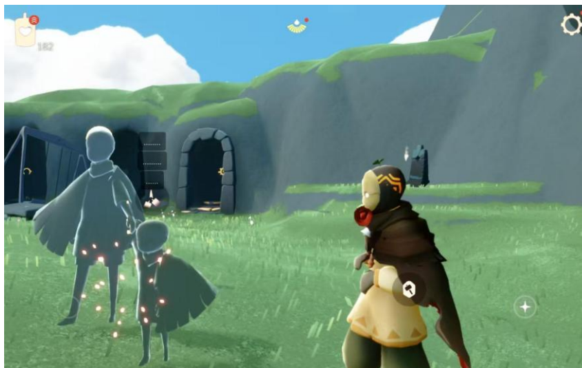
Figure 3. The Screenshot 3