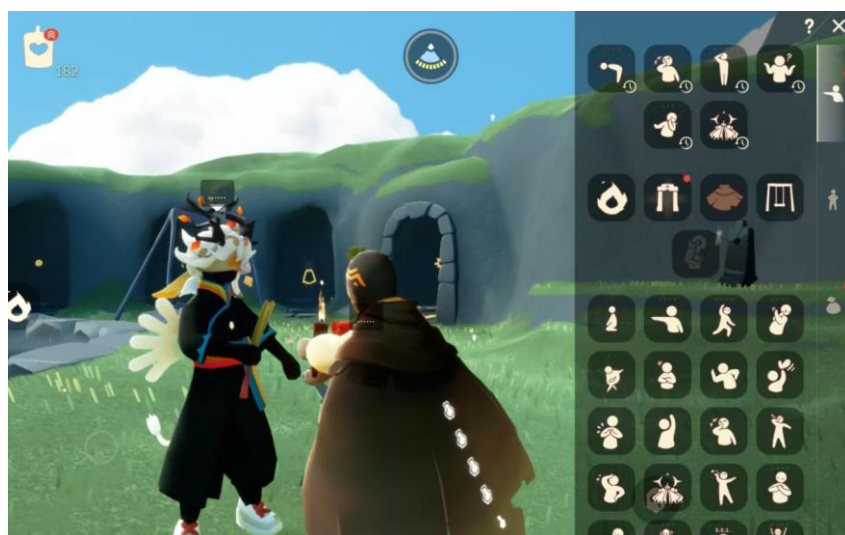
Figure 4. The Screenshot 4