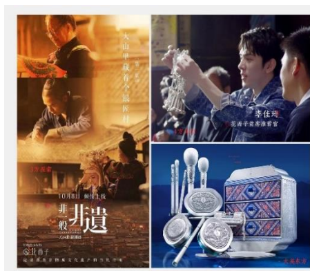
Figure 14. The Documentary "Unusual Intangible Cultural Heritage"