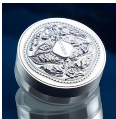
Figure 7. The High-end Tailored Air Loose Powder Compact Box

In the "Florasis · Miao Impressions" product series, the patterns on the color box packaging (Figure 8) combine the totems of the Miao ethnic group, such as butterfly patterns, fish patterns, flower - and - bird patterns, and heaven - and - earth patterns, and are reshaped and presented through hand - drawn Miao embroidery knitting methods (Figure 9). High - precision scanning technology is used to capture the delicate patterns of Miao embroidery, and computer graphics processing technology is employed to convert them into digital images, presenting the real texture of the embroidery as much as possible