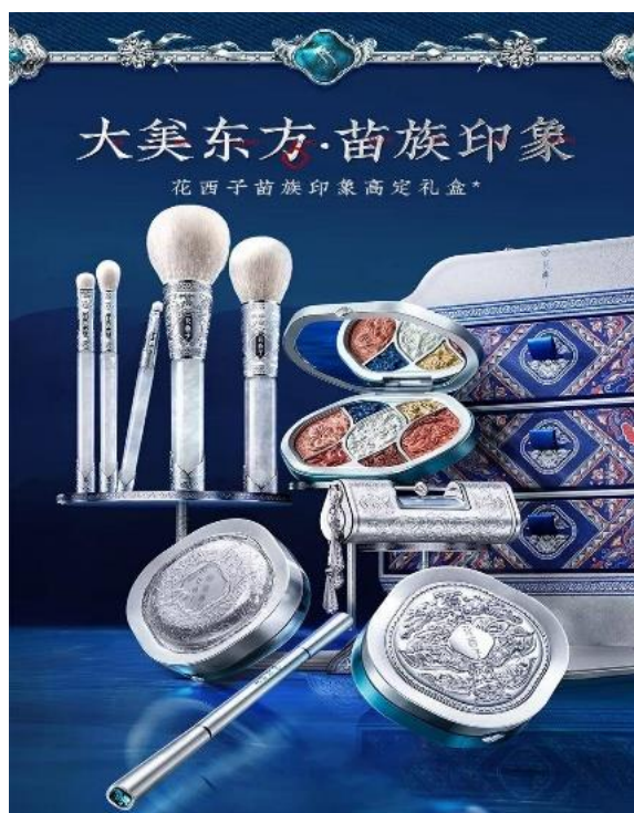
Figure 1. The "Miao Impressions" High-end Customization Series

In October 2020, Florasis' high - end "Miao Impressions" series attracted worldwide attention by relying on the Chinese intangible cultural heritage "Miao silver craftsmanship." The "Florasis · Miao Impressions" product series (Figure 1) is a representative innovative practice of the Florasis brand. It aims to present the traditional cultural elements of the Miao ethnic group to a wide range of consumers through modern digital media art design. The design concept of this product series revolves around "inheritance and innovation." By deeply exploring the intangible cultural heritage skills and totem culture of the Miao ethnic group, and combining modern aesthetics and technological means, it innovatively integrates the traditional cultural elements of the Miao ethnic group with digital media technology, creating products that are rich in cultural connotations and attractive to the market. The specific design strategies include the following aspects.