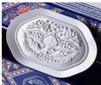
Figure 4. Design Drawing of the Embossed Cosmetic Palette with Gilt Silver Butterfly Shadows

(2) Color and Material Matching: In the selection of colors for the "Florasis · Miao Impressions" product series, full consideration has been given to the color combinations of Miao costumes and traditional handicrafts. A large number of colors such as the silver color of Miao silver, the colorful