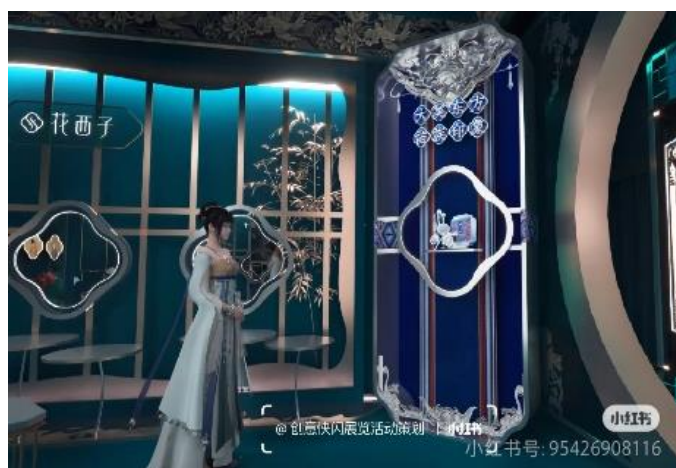
Figure 11. Florasis Virtual Reality (VR) Experience

To enable consumers to better understand the Miao culture, Florasis has launched an interactive experience application based on VR technology. Users can wear VR devices, and through 3D modeling technology, three - dimensional models of Miao architecture and costumes are constructed and dynamically demonstrated in a virtual reality scene. Users can immerse themselves in the living scenes of the Miao village, and watch the production process of Miao silver, etc. (Figure 11). This not only enhances the audience's interactive experience, but also makes the experience more interesting and allows users to understand the Miao culture more intuitively.