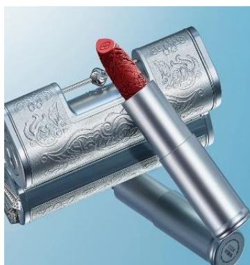
Figure 6. The Heart-shaped Lock Lipstick