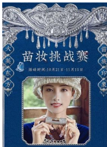
Figure 13. Miao-style Makeup Challenge

This combination of online and offline approaches has greatly enhanced consumers' sense of participation and experience. It has made Miao silver a new trend, attracting more and more young people to participate in the promotion and inheritance of intangible cultural heritage. In this way, national culture shines anew, allowing the world to witness the beauty of China.