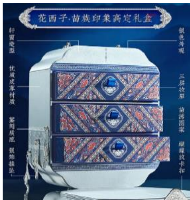
Figure 8. The Pattern of the Color Box Packaging Featuring Miao Impressions

(Figure 10), so that these intricate and beautiful handicrafts can be displayed in a virtual environment. This direct integration not only preserves the uniqueness of traditional elements but also endows them with new vitality in digital media, greatly enhancing the cultural identification and market competitiveness of the products. By integrating traditional craftsmanship with modern manufacturing technologies, designers have successfully found a path that balances tradition and modernity in digital media art design.