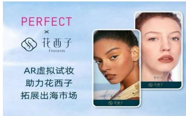
Figure 12. Florasis Augmented Reality (AR) Makeup Try-on Feature