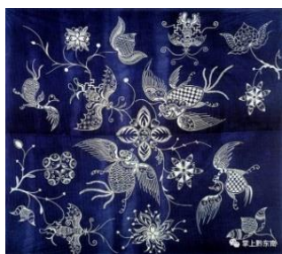
Figure 2. The Totem of "Butterfly Mother"

For example, in Florasis' "Miao Impressions High - end Custom - made Product Series", the mysterious and ancient "Butterfly Mother" totem (Figure 2) and flower elements are reconstructed and applied. The elements of butterfly wings are extracted and re - created and combined with flower elements, and then engraved onto the products to introduce the origin legend of the Miao ethnic group to young users. Just like the Gilded Silver Butterfly Shadow Relief Makeup Palette in (Figure 3 and Figure 4), the design element at its top is derived from the pattern of the Butterfly Mother in Miao legends. Through the extraction and re - design of these elements, each pattern is ensured to carry a strong cultural flavor.