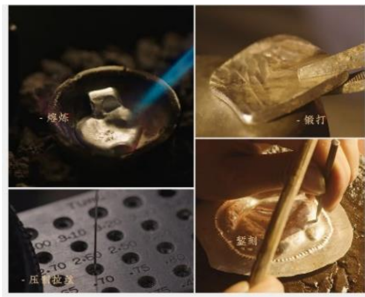
Figure 5. Forging Techniques of Miao Silver Ornaments