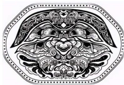
Figure 3. Design Drawing of the Embossed Cosmetic Palette with Gilt Silver Butterfly Shadows